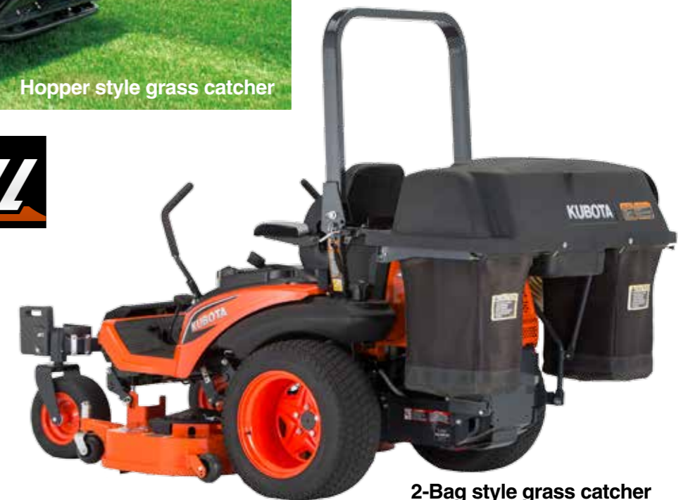
2-Bag style grass catcher

Mulch kit, work lights are available for selected models. See dealer for details.