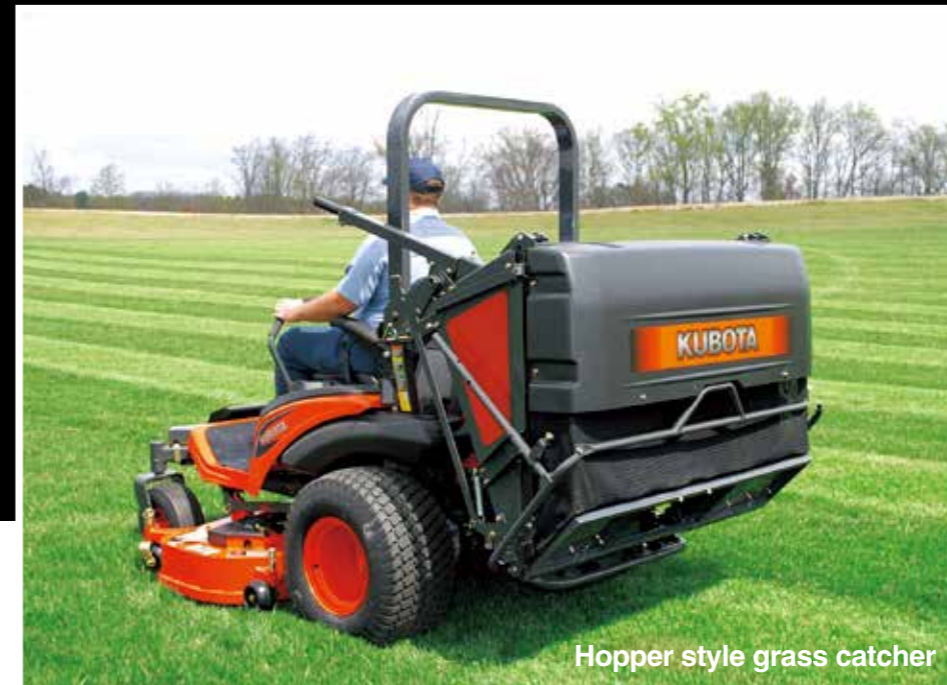
Hopper style grass catcher