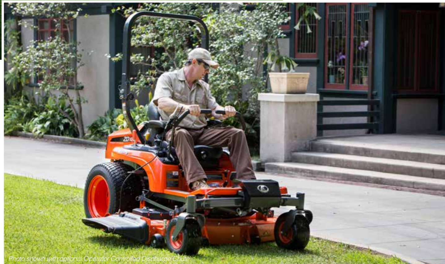
Photo shown with optional Operator Controlled Discharge Chute.