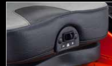
Suspension Seat Adjustment Button

The ZD1500 takes comfort to the next level with a new bucket seat. It features air-suspension that can be adjusted with the touch of a button for supremely soft support and gentle comfort that lasts until the job is done.